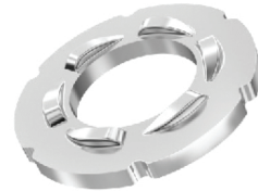
AlphaUSA Extreme Duty Direct Tension Indicating Washer