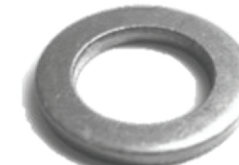
AlphaUSA Brake Line Sealing Washer Products