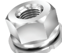
AlphaUSA Direct Tension Indicating DTI and Nut Assembly