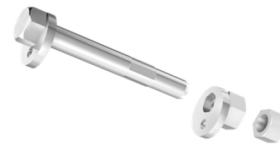
AlphaUSA Asymmetrical Shank Cam Bolt Assembly Type