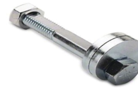
Single Flat Cam Bolt Type