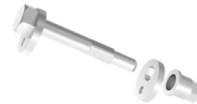
AlphaUSA Asymmetrical Shank and Spacer Cam Bolt Type