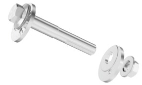
Double Groove Cam Bolt Type